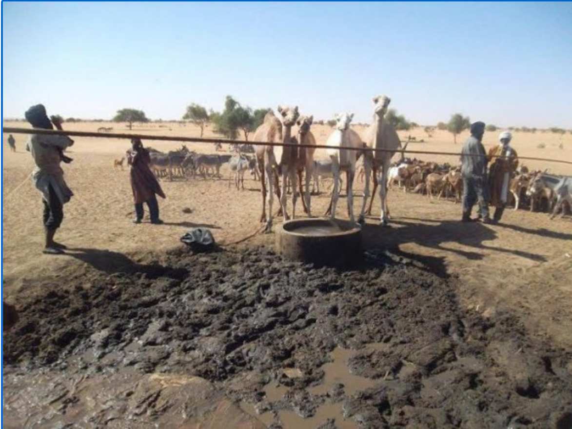
The Touaregs in the desert

proposed to exhibit for Takrist, and along the way, she invited three more artists to join and an enthralling performance by Kel Assouf. It was a fantastic weekend for everyone.